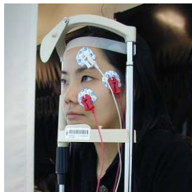
Figure 2. A photograph showing a viewer resting her head on a chin-rest and a rigid stand while wearing the EOG electrodes for eye movement measurements.